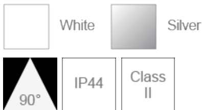
Integrated LED Luminaire F54300RCv1